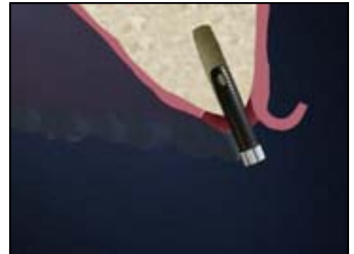
Placing an implant