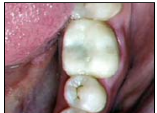
Porcelain inlays look natural